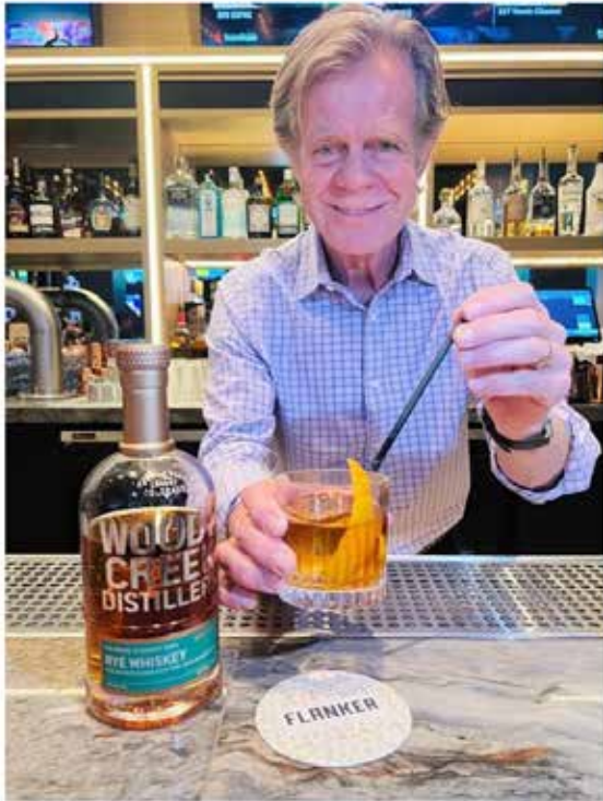
The actor prepares an Old Fashioned with his Woody Creek Distillers bourbon at Flanker Kitchen and Sports Bar at Mandalay Bay in Las Vegas, Nevada, on June 23.